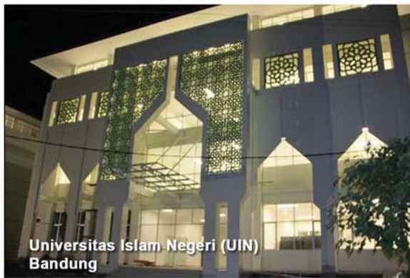
Universitas Islam Negeri (UIN) Bandung