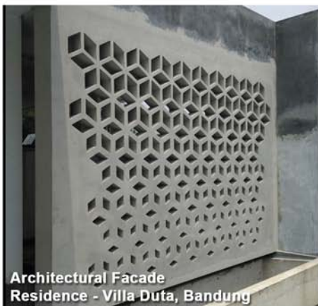
Architectural Facade Residence - Villa Duta, Bandung