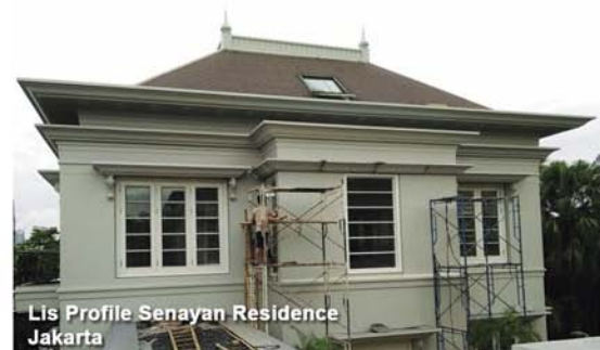
Lis Profile Senayan Residence Jakarta