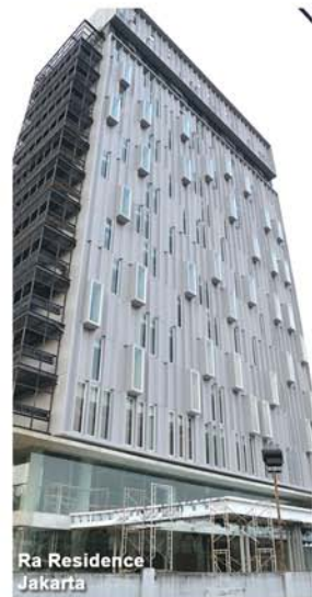
Ra Residence Jakarta