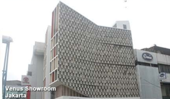
Venus Showroom Jakarta