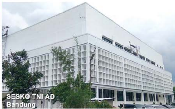
SESKO TNI AD Bandung