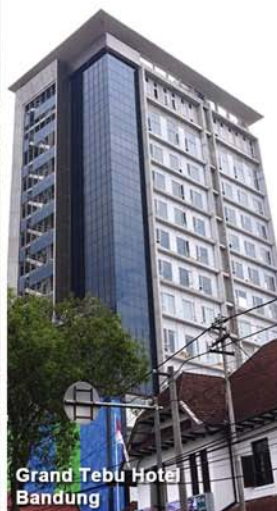
Grand Tebu Hotel Bandung