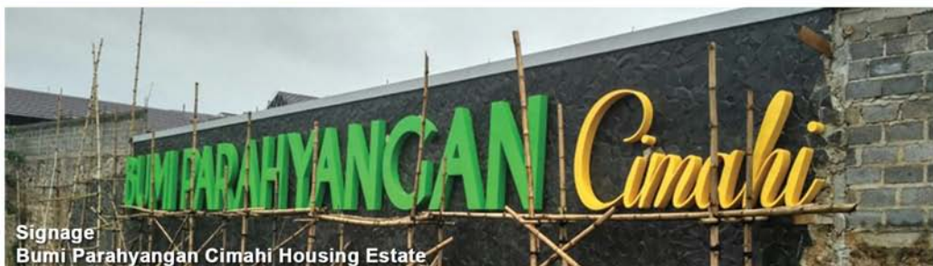
Signage Bumi Parahyangan Cimahi Housing Estate