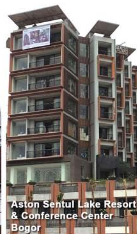
Aston Sentul Lake Resort & Conference Center Bogor