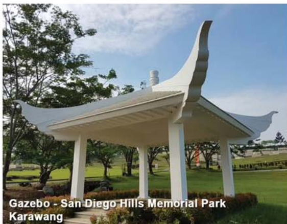
Gazebo - San Diego Hills Memorial Park Karawang