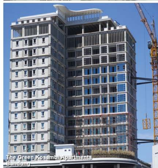
The Green Kosambi Apartments Bandung