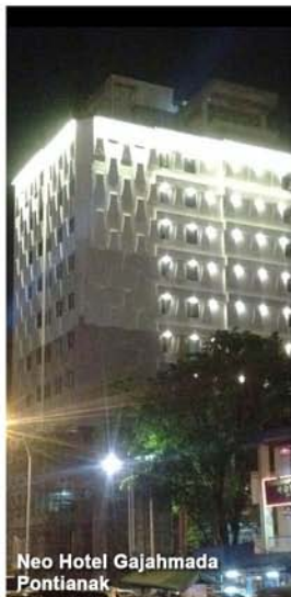
Neo Hotel Gajahmada Pontianak