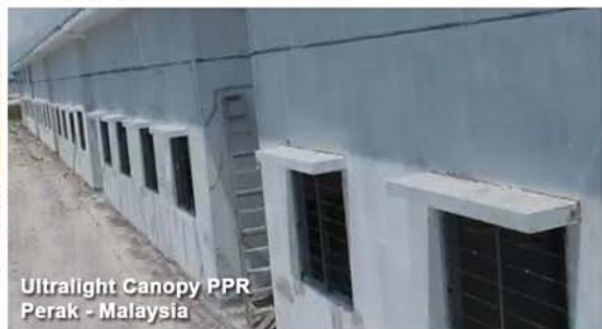
Ultralight Canopy PPR Perak - Malaysia